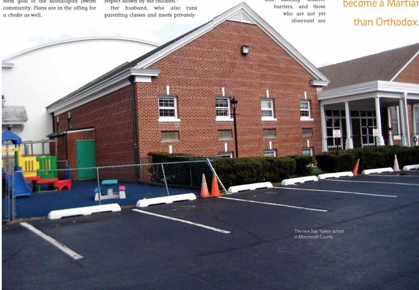
The new Bais Yaakov school in Monmouth County.